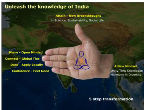
The 5-Fold Pointers Driving The Bharath Gyan Endeavour Across Decades